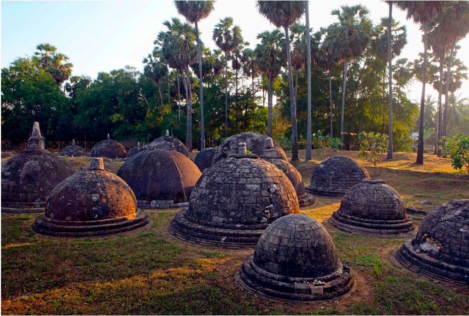
Figure 8.2 Kandarodai site.

signboard says, assuming that there was such a structure there, “was destroyed by the Dravida (south Indian) king Sangili who ruled in the 16th century.” 5 Subliminally, the history of a sixteenth-century conquest of the north by a Tamil monarch is conflated with the insurgency of the LTTE, whose territory this once was, making the Tamils perpetually disruptive outsiders and making the current Sri Lankan government and Buddhist monastic orders the joint agents in whose pastoral care the land’s original identity is finally being safeguarded (fig. 8.2).