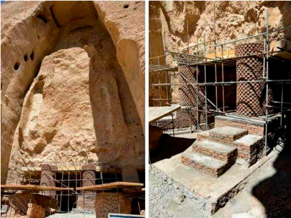
Figure 8.3 Supporting pillars for the eastern Buddha, left, with detail at right

objects and sites to be repaired and renewed. A third strand of argument began to ask whether the question of repairing and reconstructing should not shift focus from recovering things to recovering their meaning . Surely the layers of accreted meaning count for something, where the destroyed statues were not just ancient Buddhas but also mythic lovers and symbols of Hazara suffering.