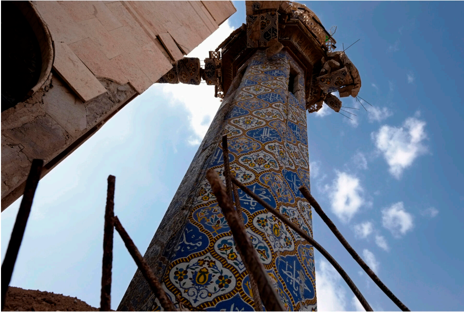
Figure 9.2 The minaret of the Sufi shrine of Sheikh Khaznawi, destroyed by ISIS militants in Tel Marouf, Syria.

the destruction of people and communities through physical genocide as defined in international law. 14 These attacks were so effective because they were embedded in a well-integrated system that combined religious ideology, a political agenda, extreme violence, and sophisticated propaganda—all amplified at a global scale to reach multiple, targeted audiences through Internet videos, digital magazines, and other social media. Nonhierarchical channels of Internet communication make these messages extremely difficult to counter or suppress.