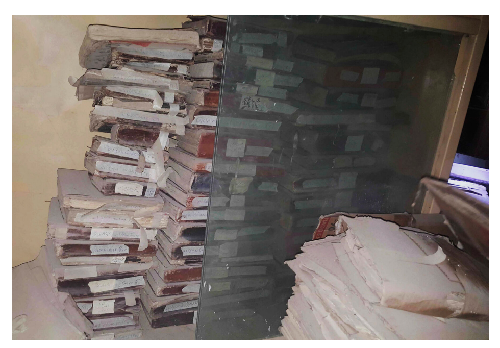
Figure 13.8 Stack of manuscripts in a private library in Yemen, 2019