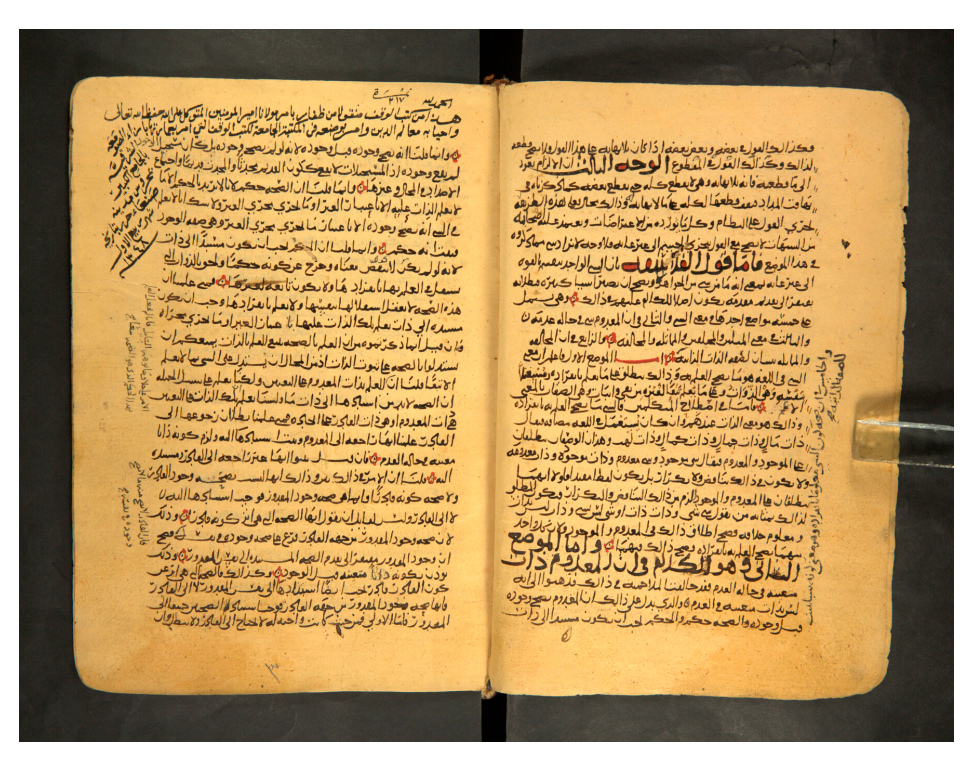
Figure 13.1 Ms. Ṣanʿā', Maktabat al-Awqāf 2318, page 2, transfer note (upper two lines and margin) for the codex from Ṭafār to Sana'a in Rabī' I 1348 (August–September 1929)