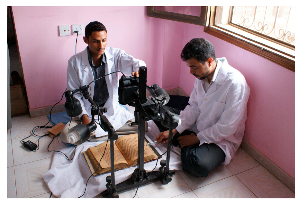
Figure 13.7 Personnel of the Imam Zayd b. Ali Cultural Foundation, Şan'ā', digitizing manuscripts, 2009

Cultural Foundation and Markaz al-Badr al-ʿilmi wa-l-thaqafi, which both endeavor to make works by Zaydi imams and scholars available through publication and to digitize private book collections (fig. 13.7).