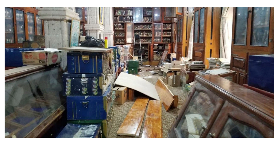
Figure 13.2 Inside the Maktabat al-Awqāf, ca. 2020

although the information about each manuscript and printed volume is kept to a minimum, it methodically records the provenance of each item. Taken together, these data allow for an inquiry into the history of the library's manuscript holdings (some four thousand items), dating from the tenth century up until the first decades of the twentieth, thus opening a representative window into the history of manuscript production and book culture in Yemen over the course of a millennium.<sup>2</sup>