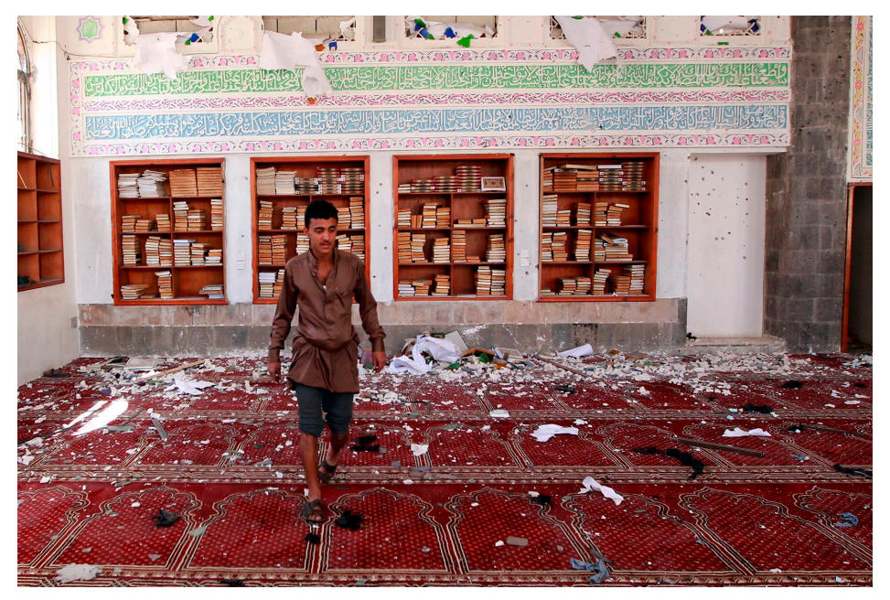
Figure 13.9 A Yemeni man inspects the damage following a bomb explosion at the Badr mosque in southern Sana'a on 20 March 2015.