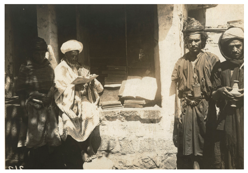
Figure 13.4 Bookshop at Sana'a, Yemen, ca. 1912.

catalogue thus testifies both to the long library tradition of Zaydi Yemen and to the continuous efforts to cleanse the curriculum through censorship and destruction and to control the literary canon (fig. 13.4).