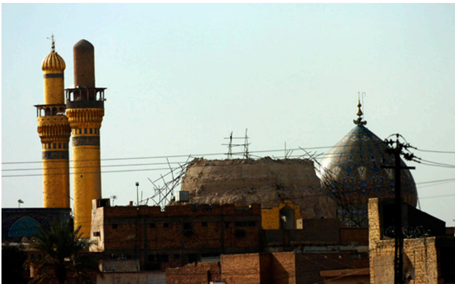
Figure 31.3 The extensive damage to the al-Askari Shrine in Samarra, Iraq in 2006 has been regarded by many as the tipping point that turned general unease with the coalition presence in Iraq into a full scale, sectarian civil war. The minarets were destroyed in 2007.

Very important damage is not restricted to major monuments or national libraries, and destruction impacts every community differently. While the heritage sector and much of the world reacted in horror in 2015–16 to the intentional destruction by ISIS of parts of the World Heritage Site of Palmyra in Syria, for the population of the adjacent town of Tadmur it was almost certainly the destruction of their cemetery, which ISIS forced male members of the community to actually carry out, that had the most telling immediate impact. 44 The use of such forced cultural property destruction as a punishment for minor religious crimes is thought unprecedented. 45 This was a clear