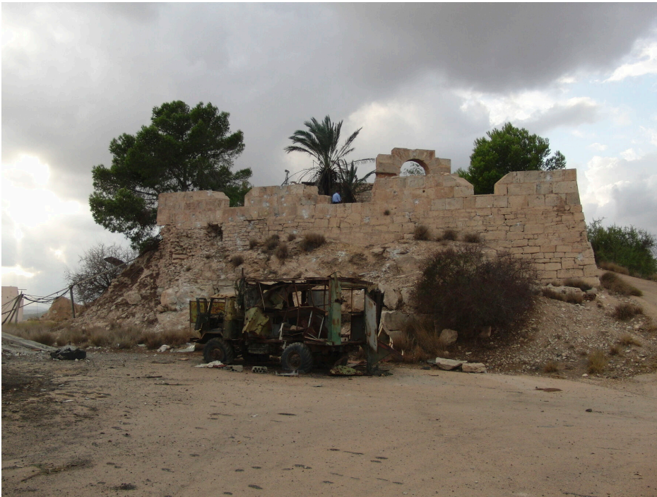
Figure 31.4 Ras Almageb, Libya, where forces loyal to the government of Muammar Gaddafi stationed six vehicles of a mobile radar/communications unit in the hope they would not be targeted because of the proximity to the Roman fort. All six were destroyed by precision weapons leaving the Roman building intact.

Despite such moves in the right direction, a great deal more work needs to be done before CPP is accepted by the political, military, and humanitarian sectors. The Blue Shield’s six areas of activity provide a framework within which it will work towards such acceptance, forming a clear agenda of what needs to be done.